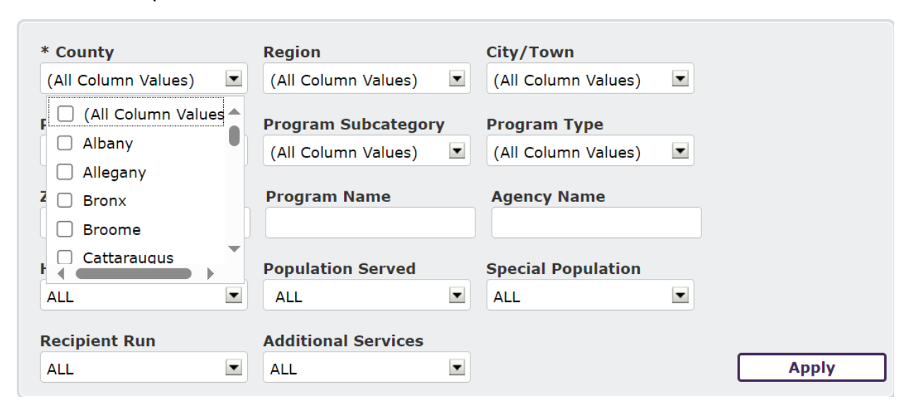
Step 3: Under "County" uncheck all column values and select the desire county where your school resides from the drop-down box.

Advanced Search page allows you to search programs by multiple criteria including: population served, special population, hours of operation, whether program is recipient run, location (e.g., city or zip code), provider or program name, and/or additional services provided.