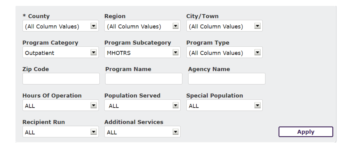
Step 5: Under "Program Subcategory" uncheck all column values and select "MHOTRS" also known as clinic.