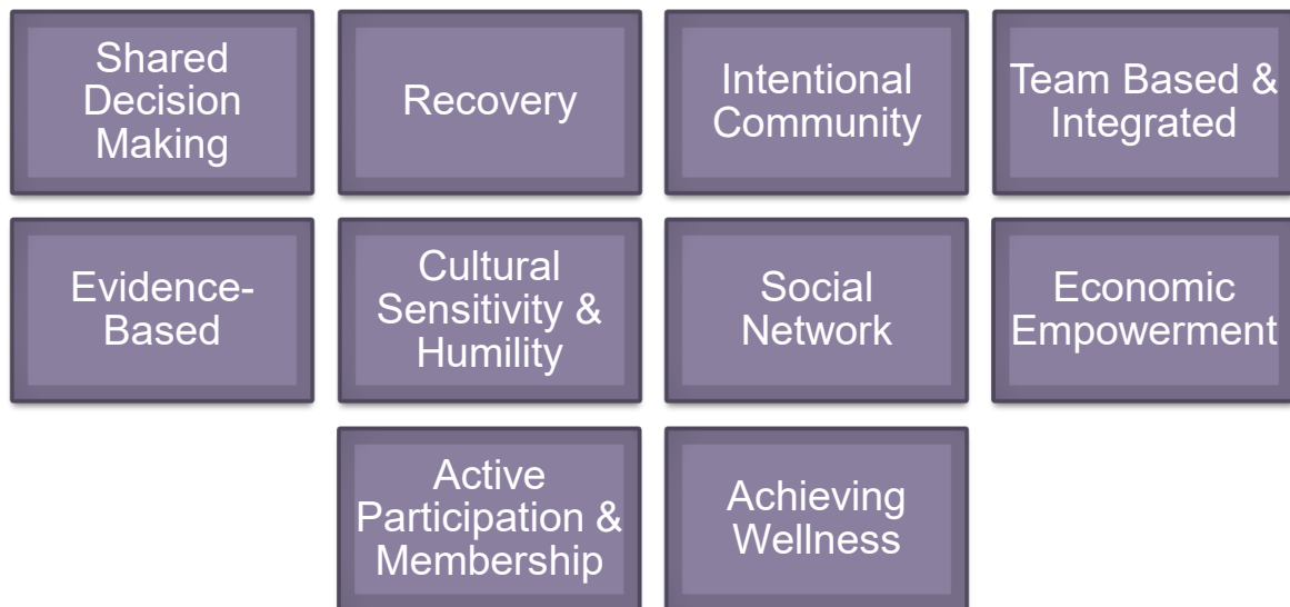
Figure 2 Key Values & Principles of the PROS Model