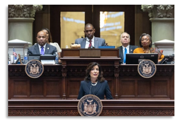
Gov. Hochul discussed housing initiatives during the State of the State address.

In January, the Governor announced more than $390 million has been awarded through bonds and subsidies to create or preserve more than 1,600 affordable, sustainable, and supportive homes across the state. When coupled with additional private funding and resources, the ten projects receiving funding are expected to create more than $600 million in overall investment that will assist local economic development efforts and advance the state's commitment to expanding the supply of safe, secure, and healthy housing opportunities for individuals and families across the state.