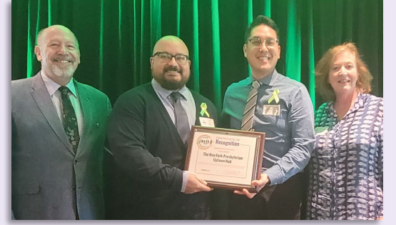
New York-Presbyterian Uptown Hub – Organization or Community Group