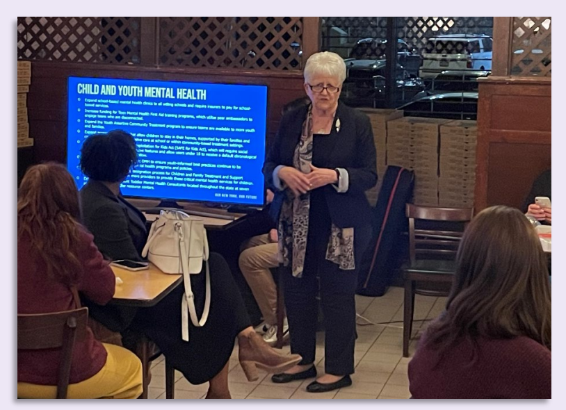
Commissioner Sullivan discussing the state mental health budget during a public meeting on Staten Island.

The Governor proposed regulations to guide the discharge of individuals from inpatient and emergency psychiatric settings and hospital emergency room settings. The budget allocates $7 million to OMH for monitoring and compliance.