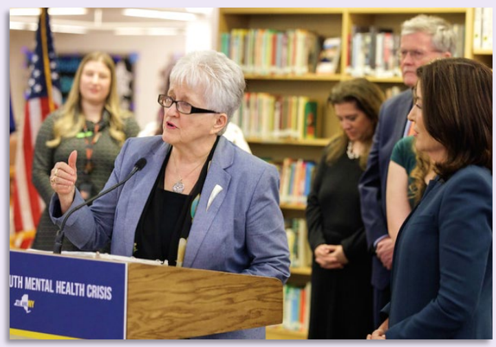
Commissioner Sullivan and Governor Hochul discussing the expansion of school-based mental health services during a meeting at Mohonasen Central School District in Rotterdam.

This funding will also establish three new 25-bed Transition-to-Home units at state-operated psychiatric centers to expand this successful program to populations in need of specialized care, including individuals with a history of recurring criminal justice involvement.