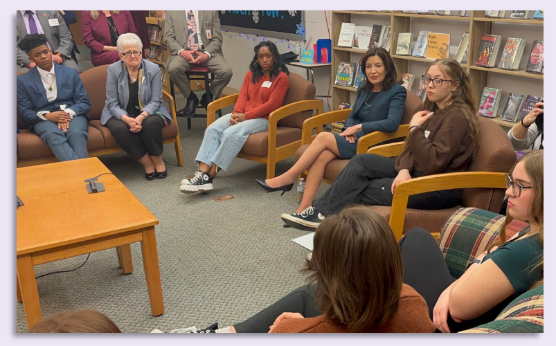
Commissioner Sullivan and Governor Hochul listening as Mohonasen Central School District students discuss mental health issues.