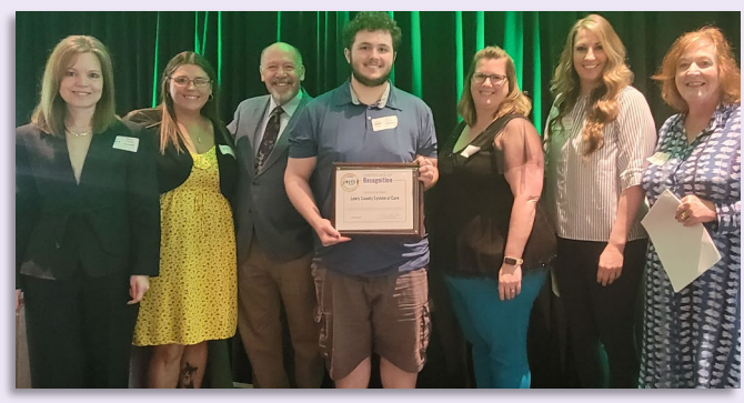
Lewis County System of Care - Systems of Care