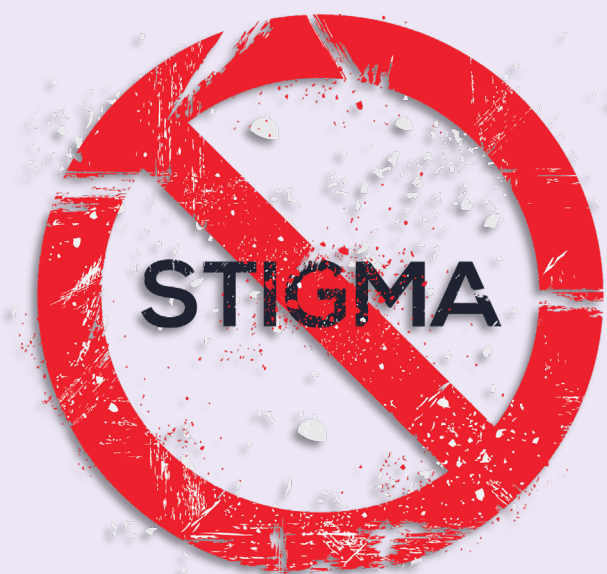
Details on OMH's anti-stigma initiatives funded through the program can be found in its <u>annual report</u>.

To be eligible, organizations must have at least one year of experience serving individuals with mental illness and be recognized for their work serving underserved, under-represented, or minority populations.